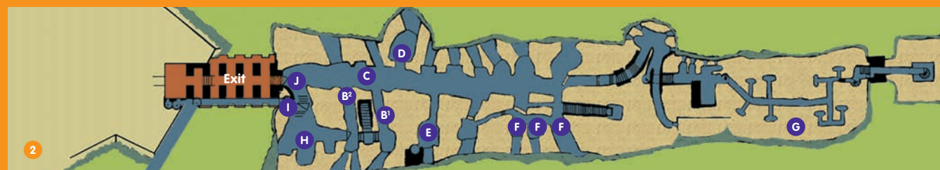
2 Bock Casemates: view from top