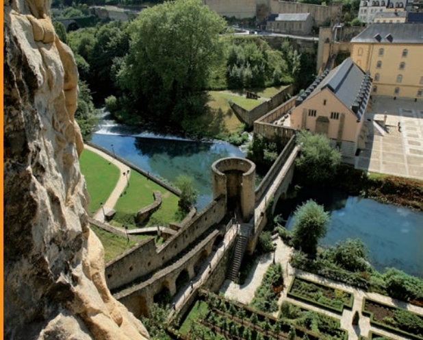
Bock Casemates: view through the loopholes