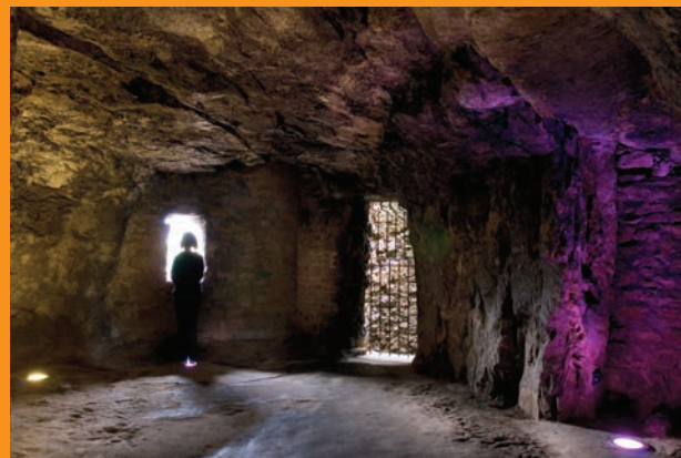
Bock Casemates: Melusine's well